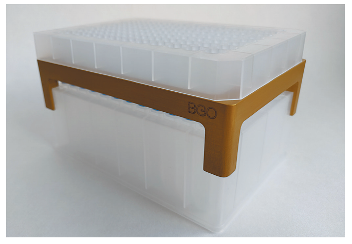
Figure 3: Elution stack assembly used for the elution step.

Prior to elution, the stack is rearranged as depicted in Figure 3.