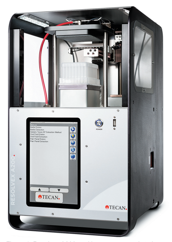
Figure 1: Resolvex A200 positive pressure workstation.

The required buffers were prepared in bottles and connected to the dispenser. Optimal working input pressure – air or nitrogen – is 5.5 bar (80 psi).