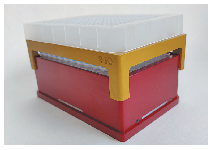
Figure 2: Processing stack assembly used for binding and washing steps comprising a Slotted Spacer BGO Gold, a Rise High Spacer BGO Red and a Barrier Long Profile Insert.

After lysis, the sample is transferred onto the NucleoSpin 96 silica membrane extraction plate, and the processing stack is assembled as shown in Figure 2, with the plate on top of a Spacer Slotted BGO Gold and Red Rise High Spacer to maintain the correct distance between the plate and waste, and placed into the Resolvex A200. The Red Rise High Spacer contains a Barrier Long Profile Insert (splash guard) to prevent cross-contamination from one silica membrane extraction plate nozzle to the next. Binding and washing steps are performed using this stack assembly, employing pressure gradients to ensure even processing across the plate. For partial plate runs, it is recommended that the unused part of the plate is sealed.